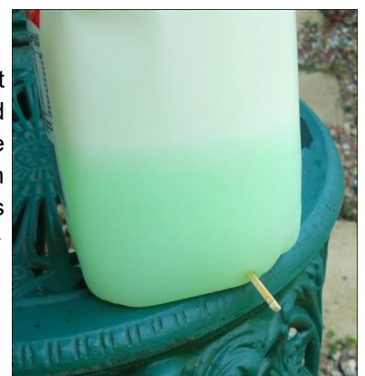
At this stage get something pointed and sharp and poke a hole in the bottom of the bottle as per picture 3 ►